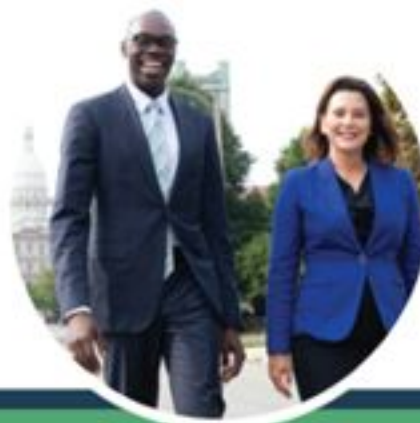
Lieutenant Governor Garlin Gilchrist